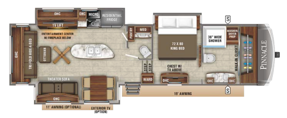
36FBTS OPTIONS: A, B, C, D