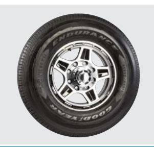
GOODYEAR BEAST TIRES Made in the U.S.A. and featuring the patented Durawall® technology.