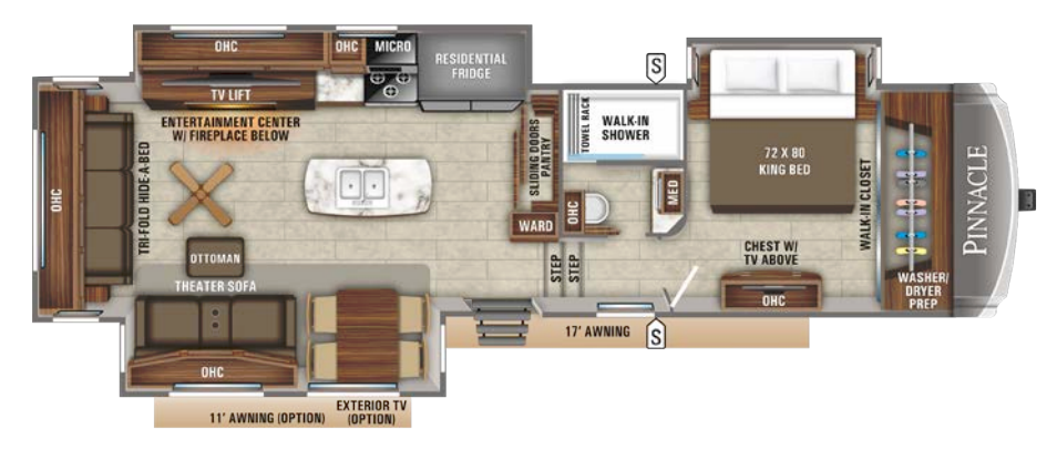
36KPTS OPTIONS: A, B, C, D