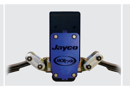
MORRYDE RUBBERIZED SUSPENSION SYSTEM Better absorbs and isolates road shock.