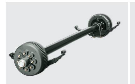
DEXTER AXLES WITH NEV-R-ADJUST BRAKES The Benchmark of the trailer industry!