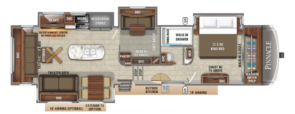
37MDQS OPTIONS: A, B, D